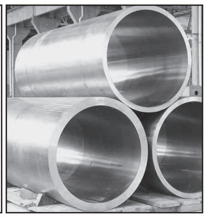
Stainless Steel Welded and Seamless Pipes & Tubes