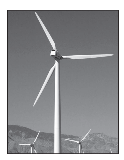
Wind Power Promoting Green Energy